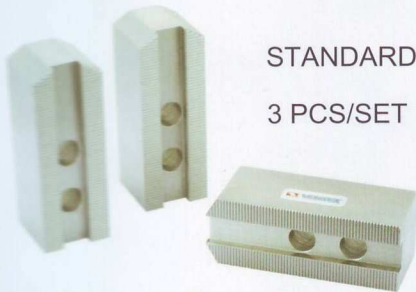
STANDARD 3 PCS/SET

1. Soft jaw for SK-type chuck. 2. Soft jaw for CNC lathe.